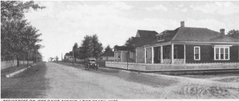
RESIDENCES ON JEFF DAVIS AVENUE, LONG BEACH, MISS.