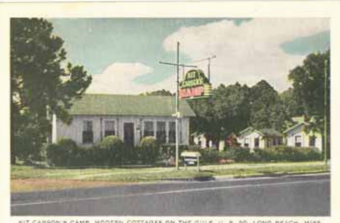
Kit Carson's Camp, on U. S. 90