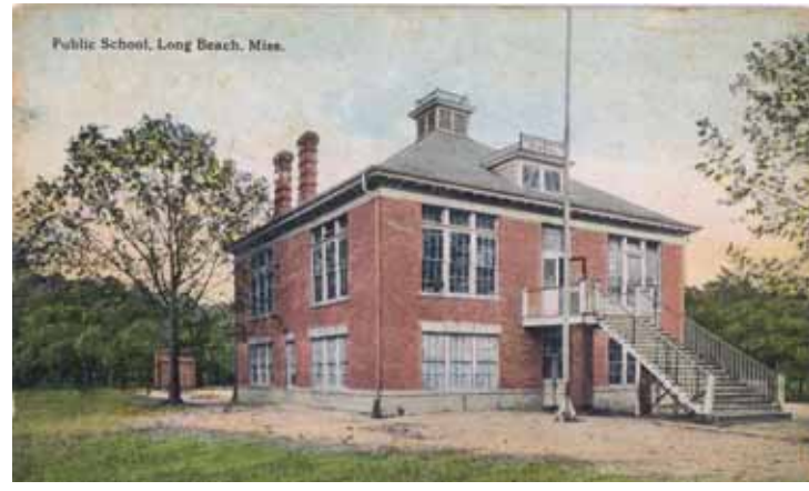
Long Beach Public School