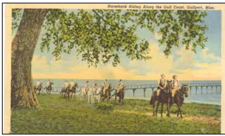
Horseback Riding Along the Gulf Coast