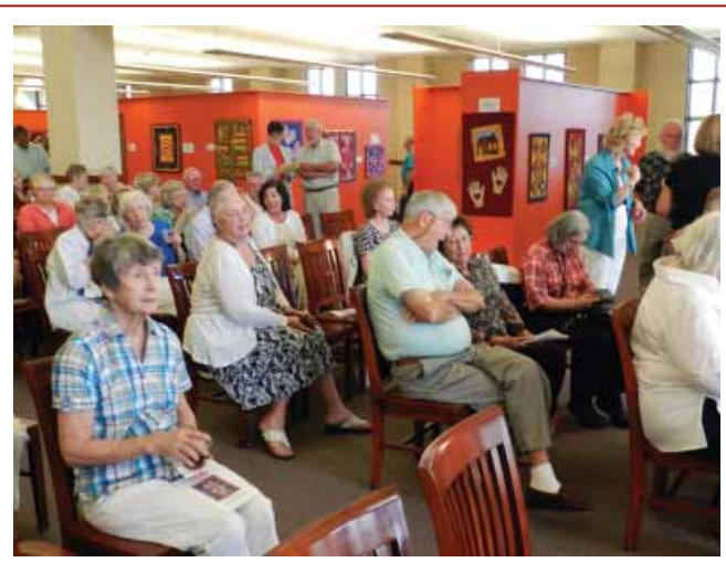
Pictured above is the audience from the Katrina Research Program at USM showing several historical society members visiting before the program began.